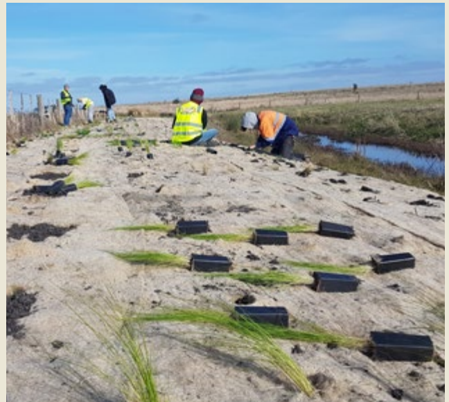
Volunteers revegetating Curly Sedge Creek

engaging volunteers in local restoration efforts, with an emphasis on Wollert Community Farm's Curly Sedge Creek, stony knolls and grassy woodlands.