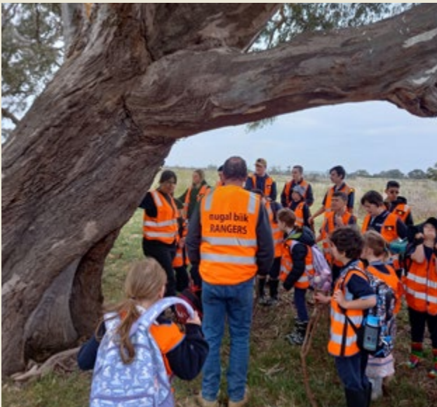
Mini and junior rangers out on Country with Wurundjeri Woi-wurrung elder

connecting local First Nations people to Country and culture through conservation and land care activities.