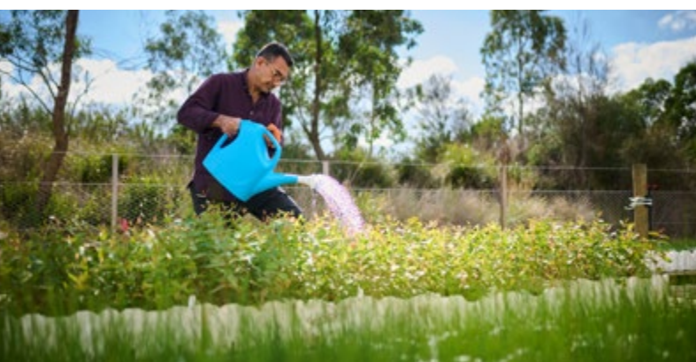
Seed Production Area at interim site